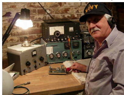
Straight Key Night (SKN)

To post a message to all the list members, send email directly to <larrystaples@mac.com>