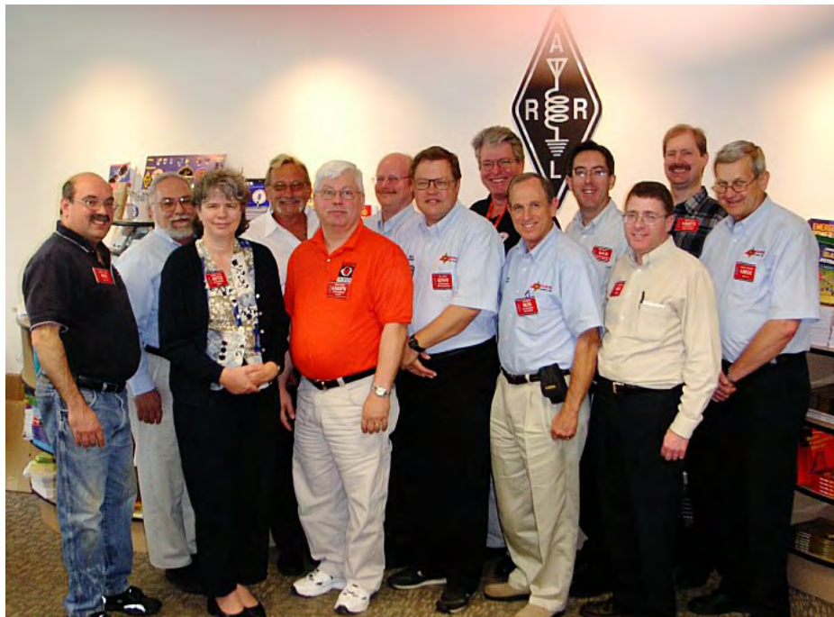
Where is Ron?

Tom Dailey - W0EAJ 720 / 839-8014 Cell radio@daileyservices.com