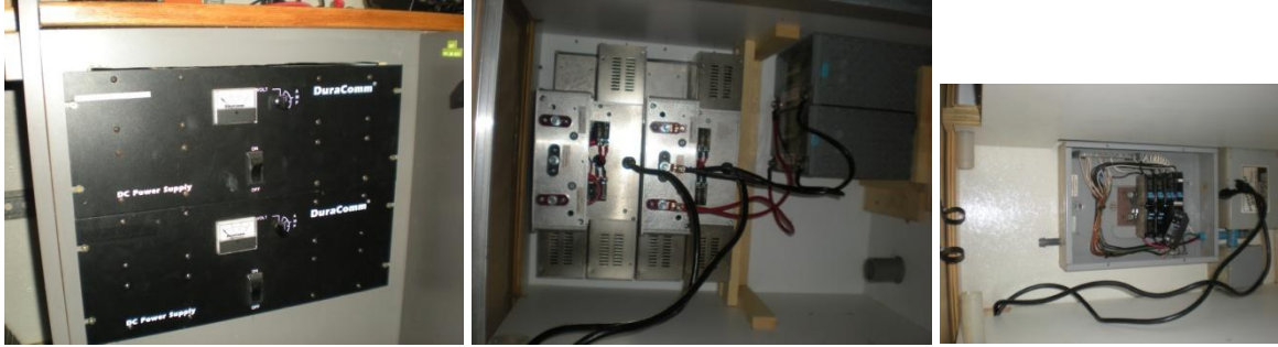
Above are power supplies inside & outside of vehicle views, & circuit breaker panels installed