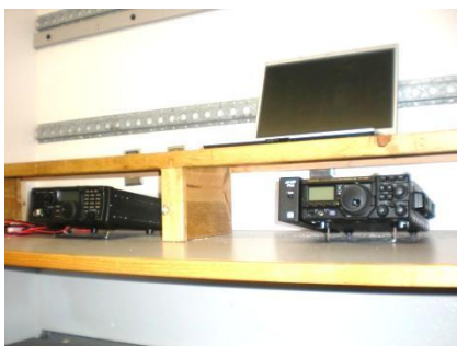
Donated Yaesu FT 897 (160 through 10 plus 6 meters 2 meters & 70 CM) & ICOM 7200 (160 through 10 plus 6 meters) installed in Communications Vehicle and awaiting antennas

Like Ground Hog Day...we have another chance to join in the fun and opportunity to say, "I was there" when The Kansas & Western Missouri Divisional SATERN Communications Vehicle was transformed into a communications machine to serve the Emergency Disaster Service.