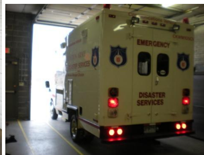
The Rig rolls out.