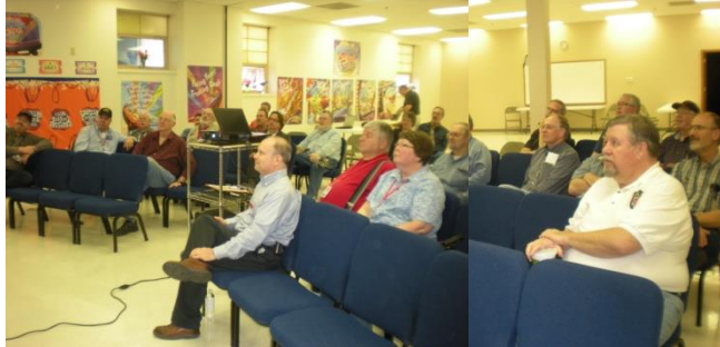
Twenty-seven members and friends attended, and donated $122.00 toward the June Jeffers Memorial Radio Room located at The Salvation Army Corps, Olathe, Kansas.

The second opportunity to volunteer was the April 8th SATERN meeting at The Salvation Army Olathe Corps, 420 East Santa Fe, Olathe, Kansas at 7pm. Communications Radio Room working party suggested bring your tools & spare radio cables, tables, etc.