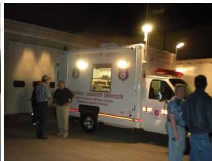
Day or night The Salvation Army SATERN Communications Vehicle is taking shape to serve.